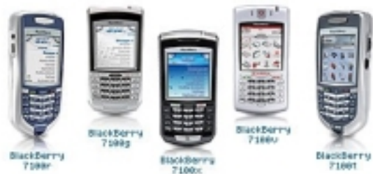
(Continued on page 2)

Collaborate and communicate more effectively and enhance your competitive advantage by responding quicker and